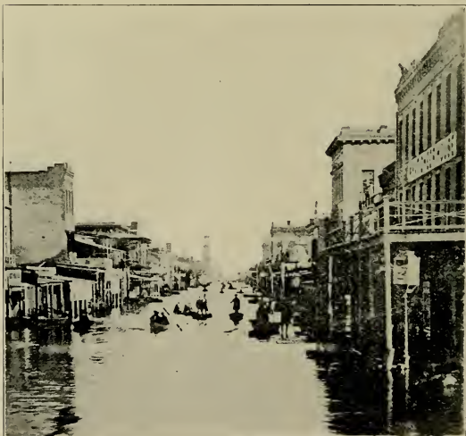
K STREET IN THE '62 FLOOD